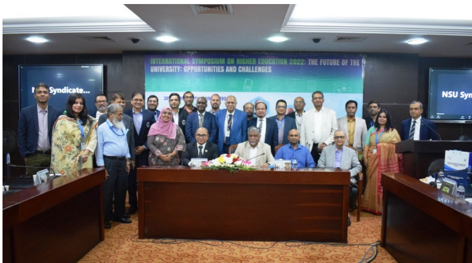
IQAC of IUBAT attended International Seminar at NSU

Director & Additional Director of IQAC attended International symposium on the future of the university: Challenges and opportunities organized by IQAC of NSU on 30 November & 01 December 2022.