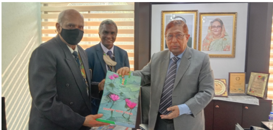
IQAC of IUBAT visits the office of Chairperson and members of BAC

Director & Additional Director of IQAC attended International symposium on the future of the university: Challenges and opportunities organized by IQAC of NSU on 30 November & 01 December 2022.