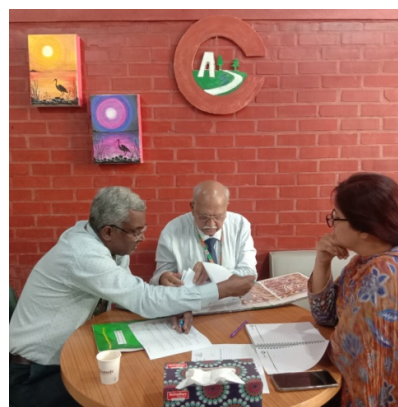
Department visits by IQAC officials for scrutinizing the course file status