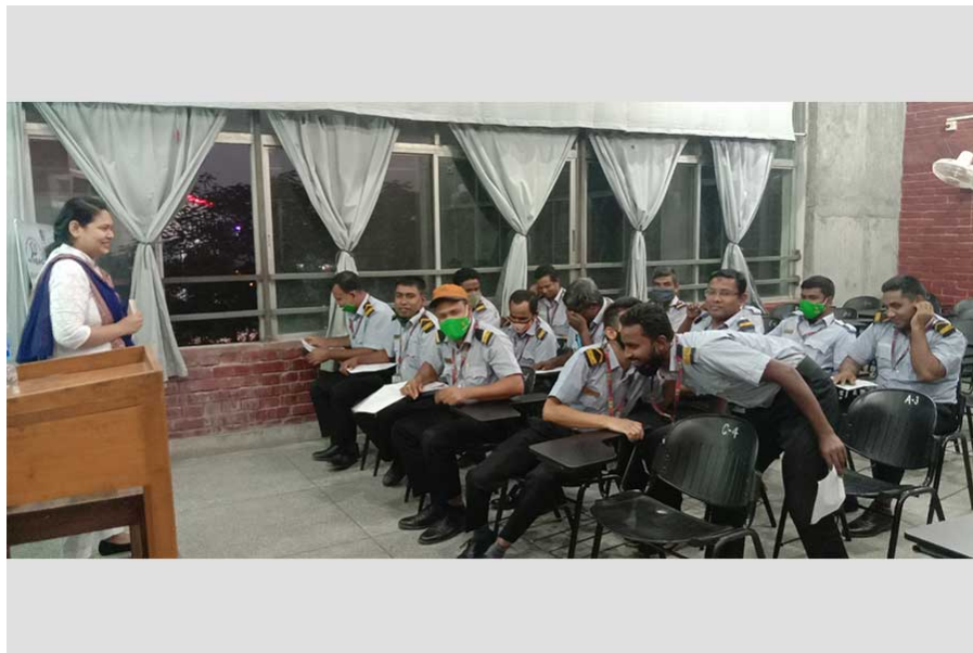
The Trainer of the Effective Communication Training with the participants in Action