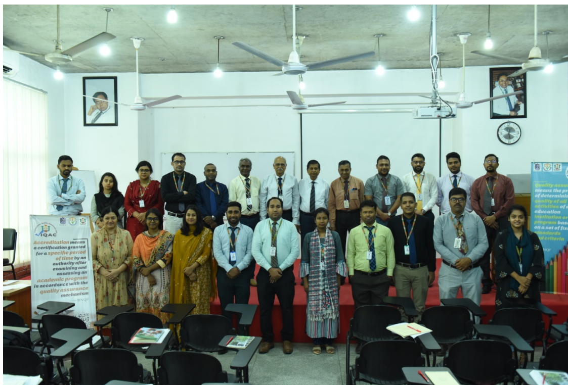
Vice Chancellor, IQAC Officials, Resource Persons and Participants of Induction Training

IQAC organized various programs both in online and hybrid mode during the 2022. Face-to-face activities were organized as per the need and suitability by maintaining necessary safety guidelines. All of the IQAC activities are categorized, aligned with the functions of IQAC stated in the IQAC Operations Manual and the latest UGC guidelines for IQAC activities, as (1) Supporting academic departments (2) QA workshop, Seminar & Training (3) AQAR workshop, survey & report (4) Conducting Employer Survey (5) Visiting depts. on Course File status (6) Class observation by IQAC (7) QAC meeting (8) Updating IQAC website and (9) Liaison with UGC, BAC and others.