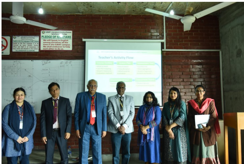
Resource persons and participants in the Workshop with statistics teachers

IQAC has been continuously providing supports, during 2022 and onwards, to the departments for preparing OBE Curricula for their respective programs. A number of review meetings were held during the year with the departments according to their needs and requests. As a part of this activity, a hands-on OBE implementation workshop for the teachers of Statistics was held in 24-Feb-2022.