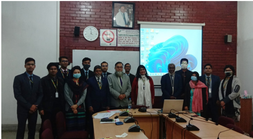
Treasurer, IQAC Official, Resource Persons and Participants of Induction Training