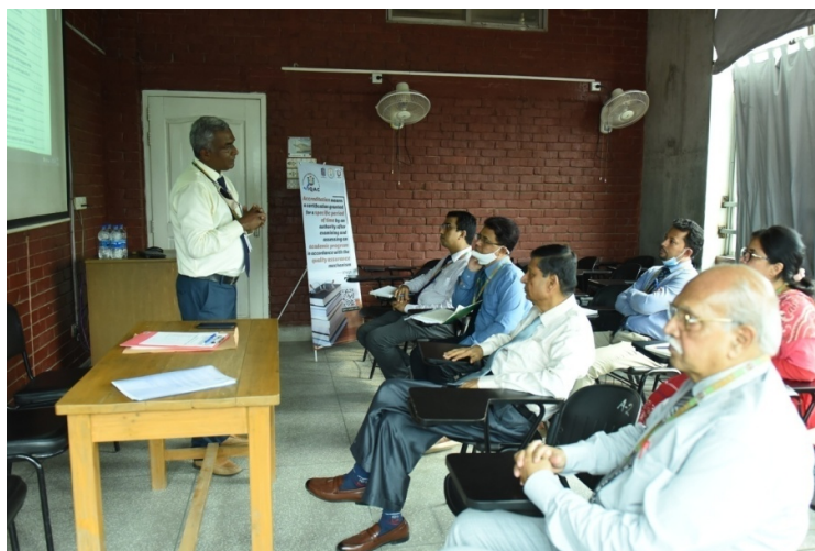
Workshop on AQAR preparation with the heads of BSAg, BA in English, and BSN programs

organized with the heads of BSAg, BA in English, BSN in 30 th May 2022 and heads of BBA, MBA, BAEcon, BATHM in 12 th June 2022.