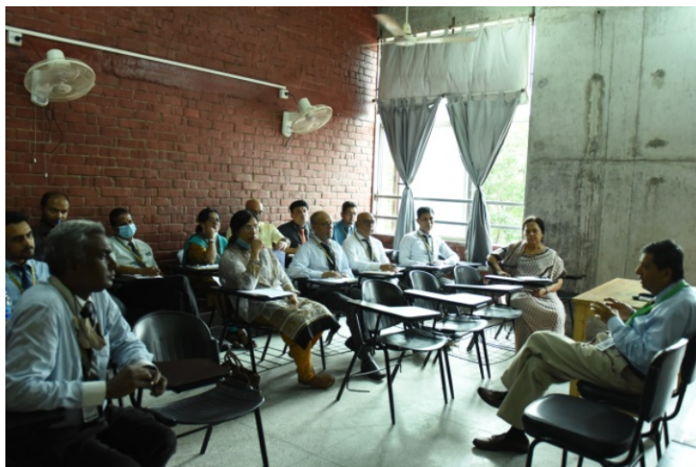
Workshop on AQAR preparation with the heads of BBA, MBA, BAEcon, and BATHM programs

A Quality Assurance Meeting was held on 26 July 2022 briefing on Annual Quality Assurance Report (AQAR) for The Departmental Heads by VC, Director & Additional Director of IQAC.