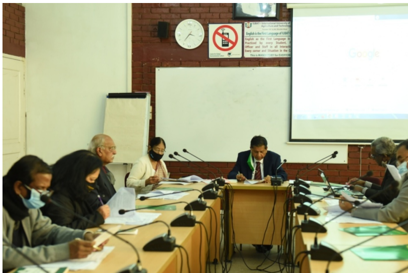
6 th QAC Meeting

Three QAC meetings were held at IUBAT during 2022. The 6 th meeting was held on Sunday, 9 th January 2022 at 3.00pm, the 7 th meeting was held on Monday, 25 th July 2022 at 3.30pm, the 8 th meeting was held on Saturday, 31 st December 2022 at 3.30pm. All of these three meetings were held in the IUBAT Conference Room (#213). After fruitful discussions, a number of decisions were taken regarding IQAC activities and quality assurance in academic activities in IUBAT.