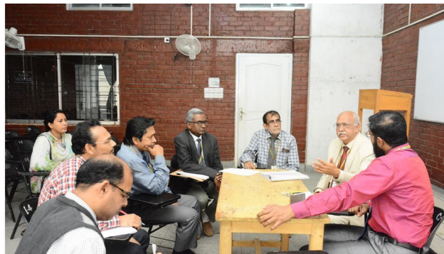
Face-to-face departmental meeting for OBE curriculum

November 2020 with all non-engineering programs. In the online discussion workshop on OBE curriculum and preparation on accreditation with BAC, 17 non-engineering faculties and departmental leaders participated.