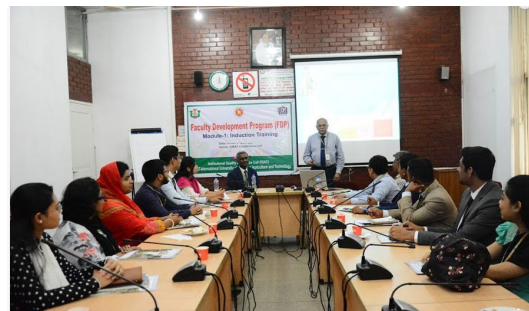
Resource persons and participants in training sessions under FDP throughout the year 2020

evaluation in an active student-centred learning approach. Total 12 teachers got training, from 24-hour training sessions held in 4 days, under the Faculty development Program (FDP) as a part of continuous quality improvement. Similar FDP programs were postponed for other