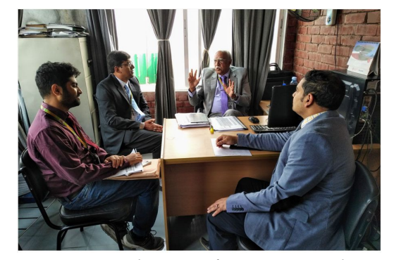
Departmental meeting for OBE curriculum

on Post Self-Assessment Improvement Plan (PSAIP), Designing Outcome Based Education (OBE) Curriculum and its implementation. Separate meetings were organized with the departments of BCSE, BSEEE, BSME, BBA, CoN, BATHM, BSAg, BSCE and BAEcon in which a total of 92 participants attended. A workshop was organized on appropriate setting of exam questions according to Bloom's Taxonomy and OBE guidance for the teachers of College of Engineering and Technology (CEAT) where 16 faculty members participated.